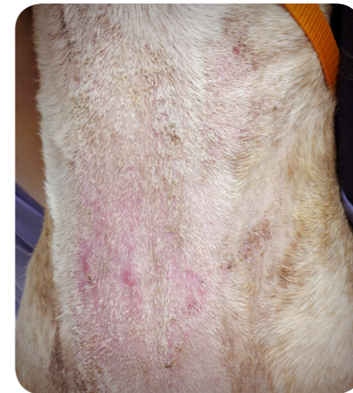
72 hrs. post-injection

IMPORTANT SAFETY INFORMATION: People with known hypersensitivity to penicillin or cephalosporins should avoid exposure to CONVENIA. Do not use in dogs or cats with a history of allergic reactions to penicillins or cephalosporins. Side effects for both dogs and cats include vomiting, diarrhea, decreased appetite/anorexia and lethargy. Please see accompanying full Prescribing Information.